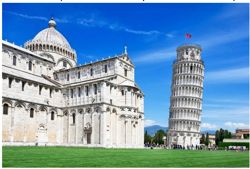
Grazie mille, Professoressa Russo

In bocca a lupo. Please submit your work once completed.